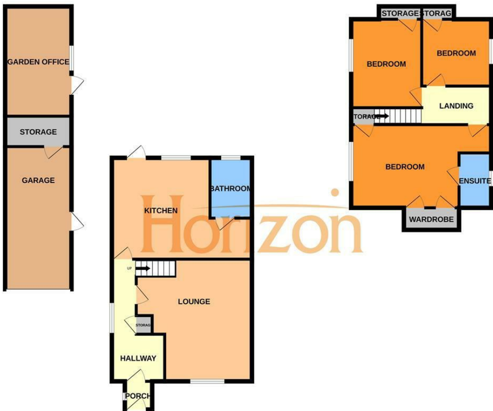
1ST FLOOR 499 sq.ft. (46.3 sq.m.) approx.

TOTAL FLOOR AREA : 1385 sq.ft. (128.7 sq.m.) approx.